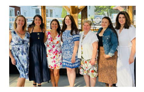
To get to know our staff, visit DavidsRefuge.org